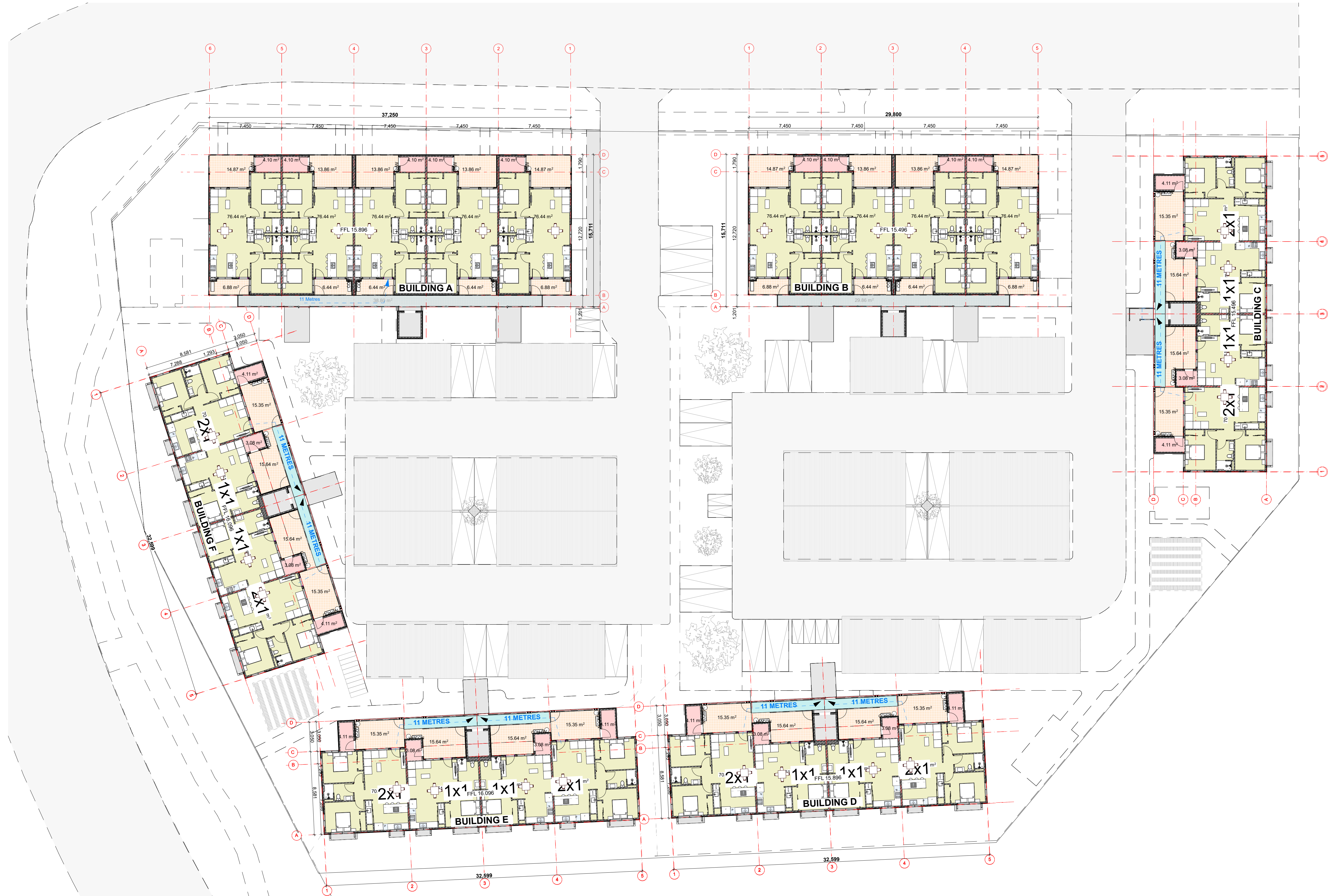
Overall - Second Floor Plan Scale 1:200