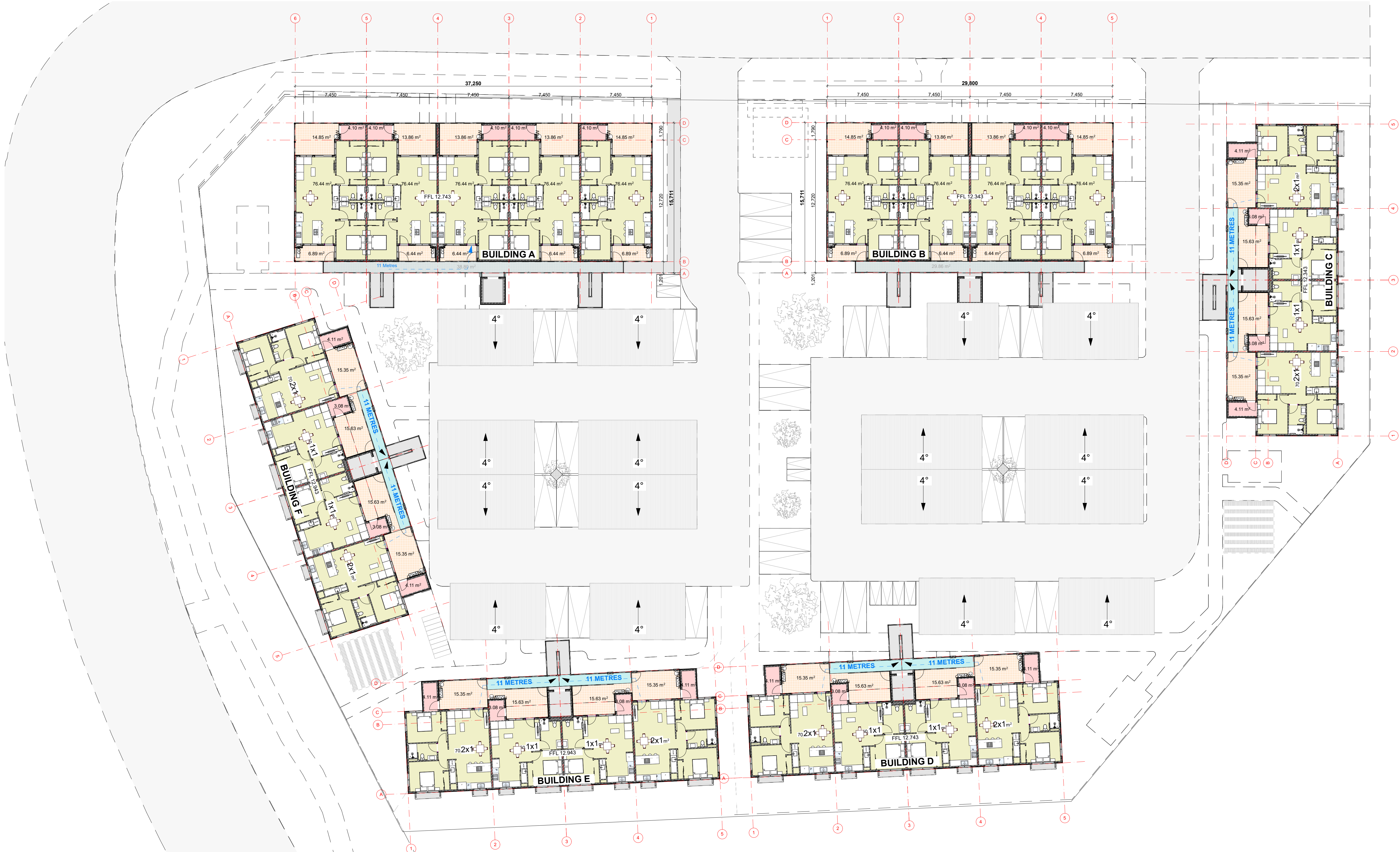
Overall - First Floor Plan Scale 1:200